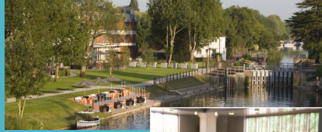
The Runnymede on Thames Hotel

When you're sipping your cappuccino and admiring the gorgeous views from this award-winning riverside aware of the richness of