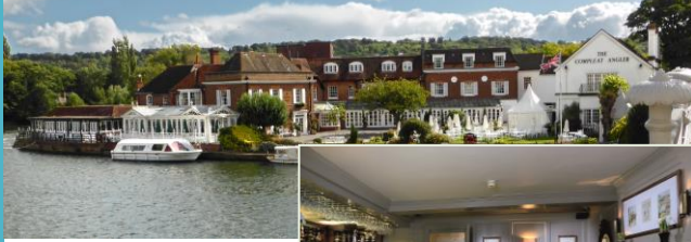
The Macdonald Compleat Angler

The Thames is at its loveliest as it flows through this pleasant Georgian market town. prosperous shops, restaurants and bistros. The Macdonald Compleat Angler offers luxurious accommodation, next to the cascading waters of Marlow Weir. It is the perfect place to relax, by a roaring log fire, after a day exploring all the delights the local area has to offer.